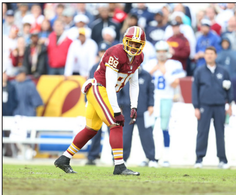
Last season, Santana Moss joined Tony Gonzalez, Reggie Wayne, Andre Johnson, Steve Smith, Larry Fitzgerald and Anquan Boldin as the only then-active players to reach 10,000 career receiving yards.