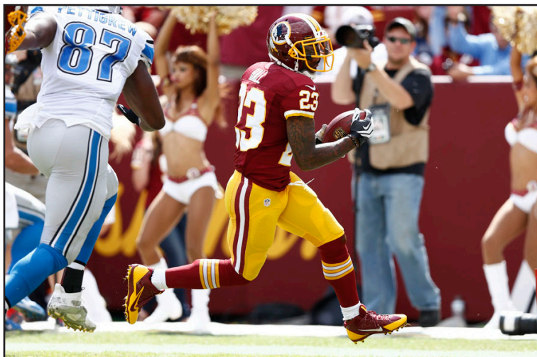
CB DeAngelo Hall