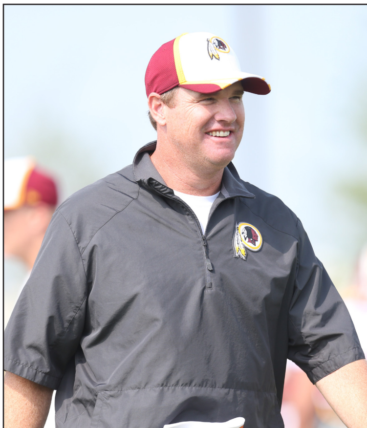
Jay Gruden, 46, became the youngest head coach hired by the Redskins on a non-interim basis since the team hired 40-year-old Joe Gibbs in 1981.