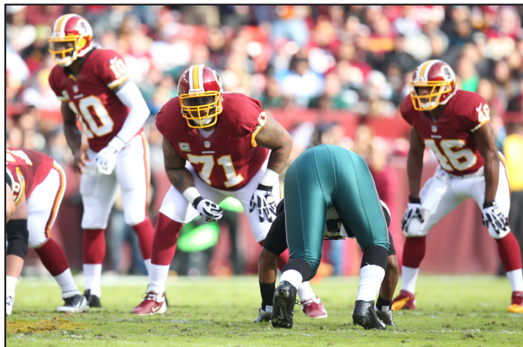
T Trent Williams