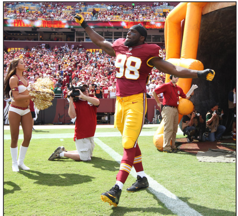
LB Brian Orakpo

Opposing offenses will once again have to account for the man known as Rak, Brian Orakpo , who returned to Washington on a franchise tag after making his third career Pro Bowl with a 10-sack season in 2013. Orakpo sits fifth all-time in sacks in Redskins history and sits 4.5 sacks away from sole possession of third place. He forms half of one of the league's top outside combinations with fourth-year veteran Ryan Kerrigan , a Pro Bowler from the 2012 season who has posted at least 7.5 sacks every season, posted 10 career forced fumbles, recorded two pick-sixes all despite rarely getting a defensive snap away from the field in 48 career games.