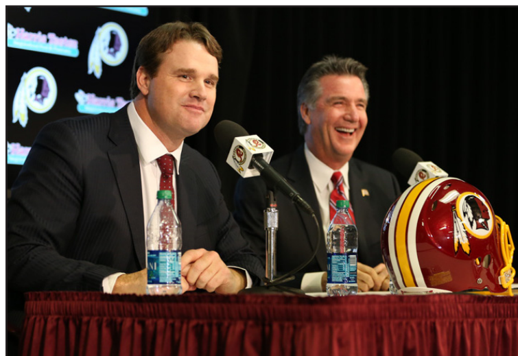
On Jan. 9, 2014, Redskins Executive Vice President/General Manager (right) introduced Jay Gruden as the 29th head coach in franchise history. "There's a great history here for the Washington Redskins and there's a lot of pride here," Gruden said. "They [fans] want a winner. They don't expect anything else."