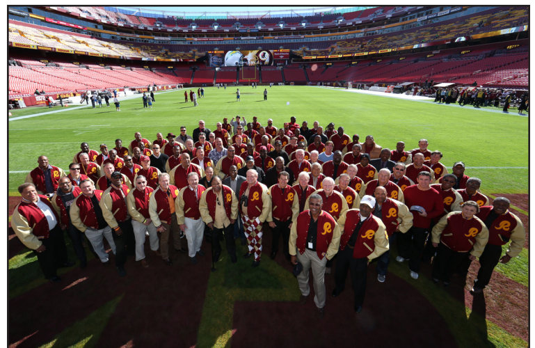
The Redskins hosted their annual Homecoming Game in Week 9 against the San Diego Chargers. At halftime, the team honored alumni from the Super Bowl XXII championship team, including Super Bowl XXII MVP Doug Williams, who addressed the crowd at FedExField.