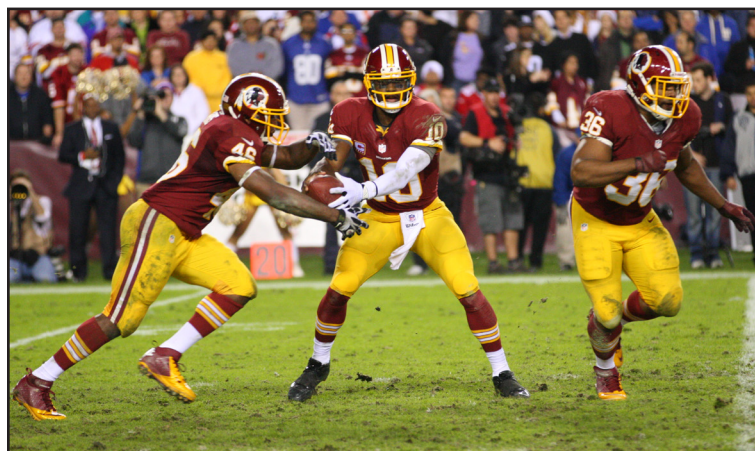
RB Alfred Morris, QB Robert Griffin III and FB Darrel Young

The group also features two fourth-year backs in Roy Helu, Jr. , and Evan Royster , both selected by the Redskins in the 2011 NFL Draft. In their first three seasons, the two have played a combined 66 games in burgundy and gold and earned seven combined starts down the stretch of their rookie